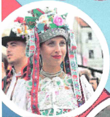
BEAUTIFUL FOLK COSTUMES